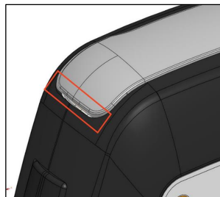
Illustration 2: Battery housing