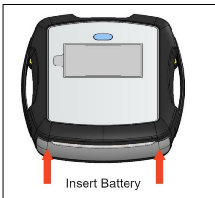
Illustration 1: Inserting the battery