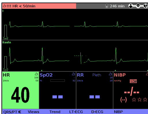
Figure 3: Alarm (top left) and inverted parameter field