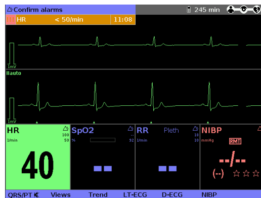
Figure 4: Alarm confirmation request