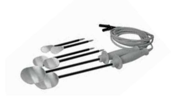
▶ Shock spoon in three sizes for use during open heart surgery.

Weight and size are reduced to the necessary minimum without any compromise in functionality. The pre-connected therapy electrodes and the optional accessory bag also optimise handling.